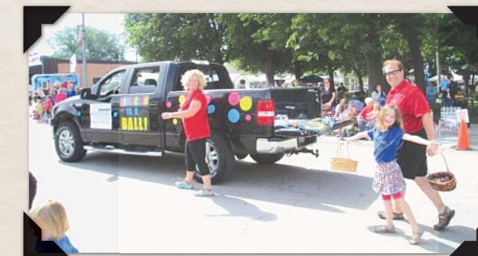
Security Savings Bank and the entire Clarion branch team (and family) represented the Festival in the Park parade. Security Bank was a title sponsor for this event.