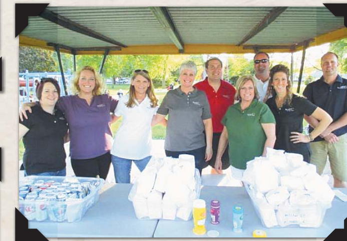
Security Bank sponsored the first Movie in the Park on Wednesday, May 28th. The Eagle Grove Parks and Rec presented the Disney movie Frozen. Over 350 attended and Security Bank employees enjoyed hosting the event.