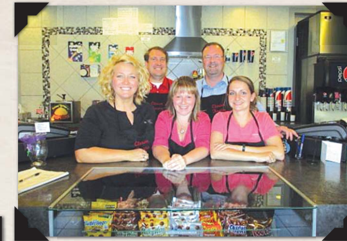
The Clarion branch team volunteered at the Clarion movie theater on June 11th. They handled all ticket sales, sold concessions and helped clean up after the show.