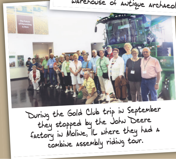
During the Gold Club trip in September they stopped by the John Deere factory in Moline, IL where they had a combine assembly riding tour.