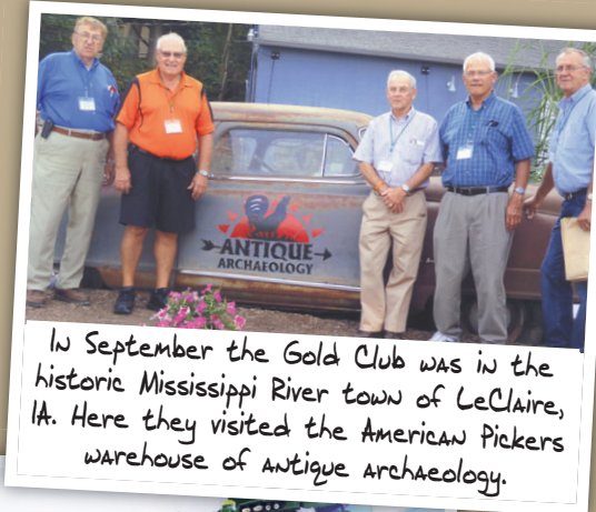
In September the Gold Club was in the historic Mississippi River town of LeClaire, IA. Here they visited the American Pickers warehouse of Antique Archaeology.